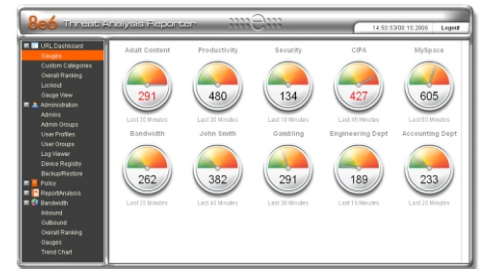
Real-time Threat Dashboard