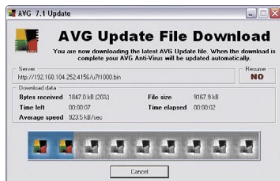
Downloading update files