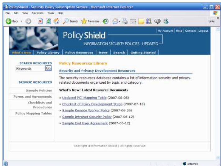
The PolicyShield web-based application interface allows easy navigation and quick searching.

PolicyShield’s secure web-based system is easy to navigate and allows you to quickly locate the information you need, when you need it. Browse or search for policies by keyword, ISO category or topic. Each pre-written policy comes with pre-written implementation advice and links to related policies, real-world incidents, and resources to help implement each policy with your organization.