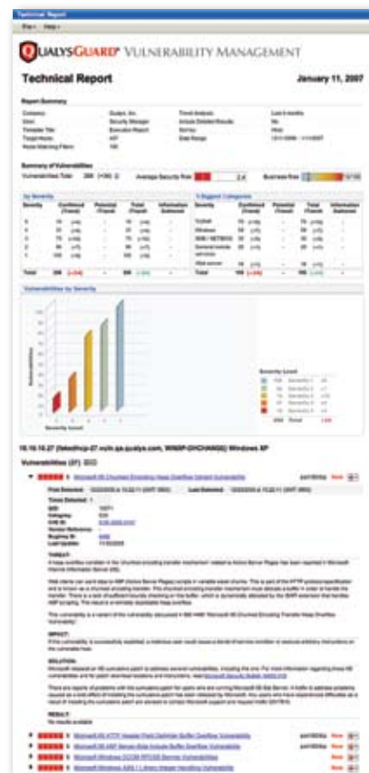
Vulnerability Risk Report